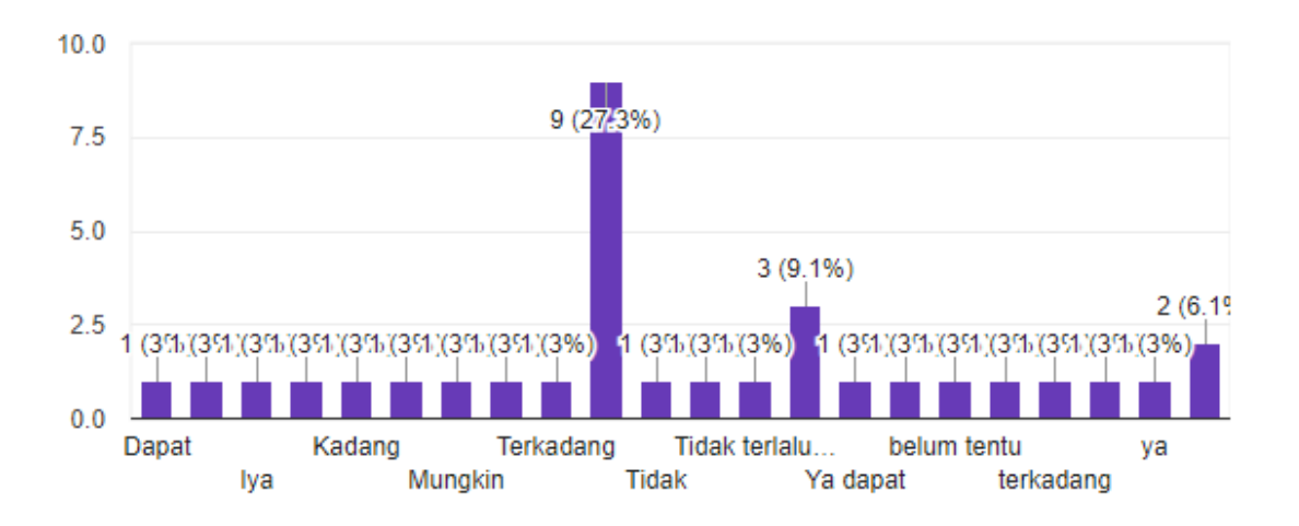
Figure 2. Percentage of Use of Google Translate as needed

The percentage of the graph above shows that around 27.3% admit that Google Translate cannot translate according to the needs of students. Only 9.1% think Google Translate can translate according to student needs. While the average student still gives a relative answer.