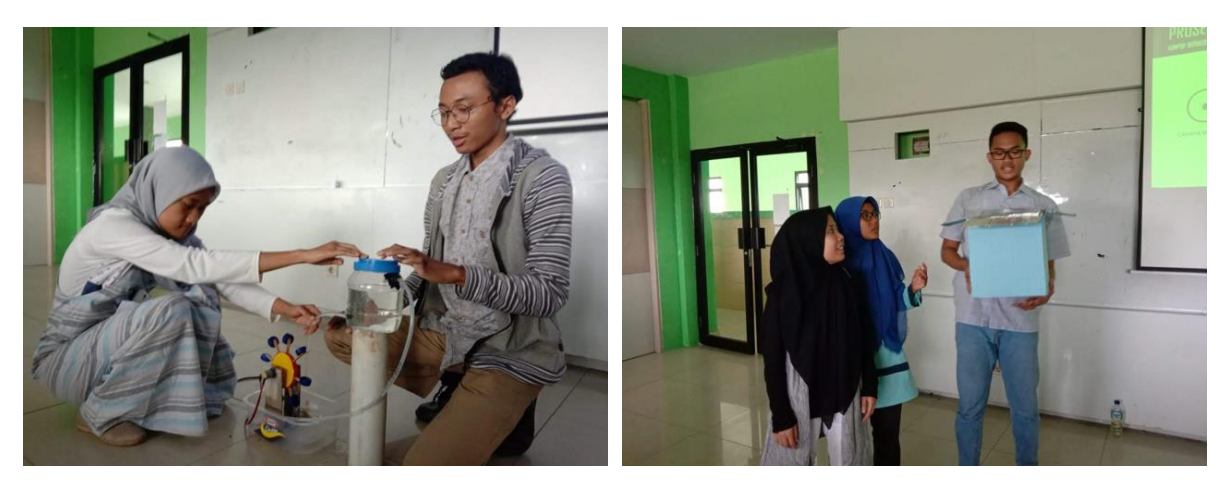
FIGURE 4. Products produced from STEM learning based on local fan diaries.

The third meeting of each group presented the results of the products they made. They explained the difficulties in making products, how the products work, to the advantages and disadvantages of the product. Then in the question and answer session, the other groups of students asked questions to enter how the product should be repaired.