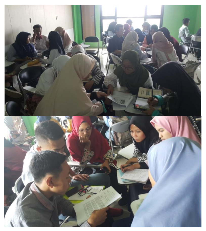
FIGURE 3. Each group discusses worksheets.

The third meeting of each group presented the results of the products they made. They explained the difficulties in making products, how the products work, to the advantages and disadvantages of the product. Then in the question and answer session, the other groups of students asked questions to enter how the product should be repaired.