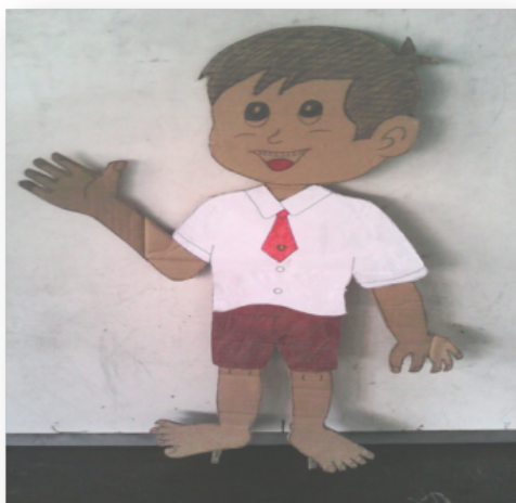
Figure 1 Happy Body media created by researchers (Researcher's source document)

of the learning process. Value data obtained from formative tests and observations from the observation sheet.