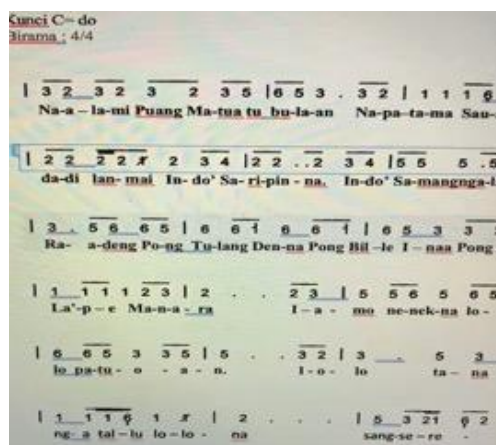
Figure 3. Video of song Tallulolona