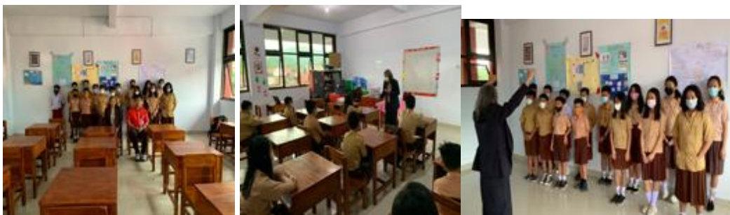
Figure 4. Student, Teacher, dan Researcher

At the time of observation at school, students have started learning face-to-face. Activities carried out during monitoring by asking students to sing songs that have been sent. Sing together in class.