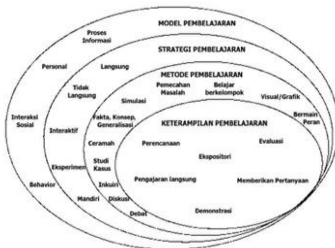
Figure 1. Position of Model in Learning (Tatik Suryani, & Endang Mastuti Rahayu, 2018 PKT Module 04)

Learning is an activity or action taken by someone to someone, so that learning occurs within the individual. In short, it can be said that learning is a way or method used to teach someone. In short, learning is the process of learning people. The process of interaction between students and educators and learning resources in a learning environment is learning. Learning is assistance provided by educators so that the process of acquiring knowledge, mastering skills and character, and forming attitudes and beliefs in students can occur. In other words, learning is a process to help students learn well. (Ahdar Jamaluddin and Wardana, 2019)