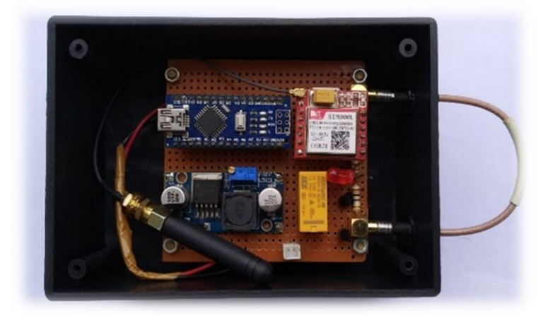
FIGURE 2. Prototype of Electronic Seal Development Results

FIGURE 1 shows the block diagram of the electronic seal working principle, where the working principle of the electronic seal was when the cable seal is broken, then the amplifier circuit would generate voltage to the relay, the relay would activate Arduino to instruct the GSM module to send data to perform certain functions. This relay would also activate the LED as an indicator if the seal was broken and would activate the DC step-down converter to reduce the relay output voltage to GSM operational voltage. For sending SMS and GPRS using data communication media on cellular network systems.