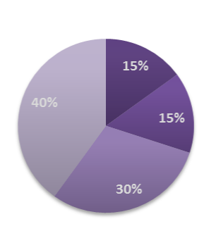
Figure 3. Libyan Students' Major Preferences of Learning Style

Libyan students are tactile (8), kinesthethic (6), auditory (3), and visual (3).