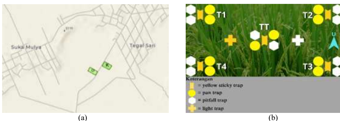
FIGURE 1. Map of the study site in Tegal Sari Village (a) and schematic layout of insect trap placement in organic and conventional rice fields (b).

The research was conducted from December 2024 to March 2025 in Tegal Sari Village, Semendawai Suku III Subdistrict, Ogan Komering Ulu Timur Regency, South Sumatra, Indonesia. The site was selected due to two contrasting rice cultivation systems—organic and conventional—each represented by a field of at least 0.5 hectares and planted with different rice varieties.