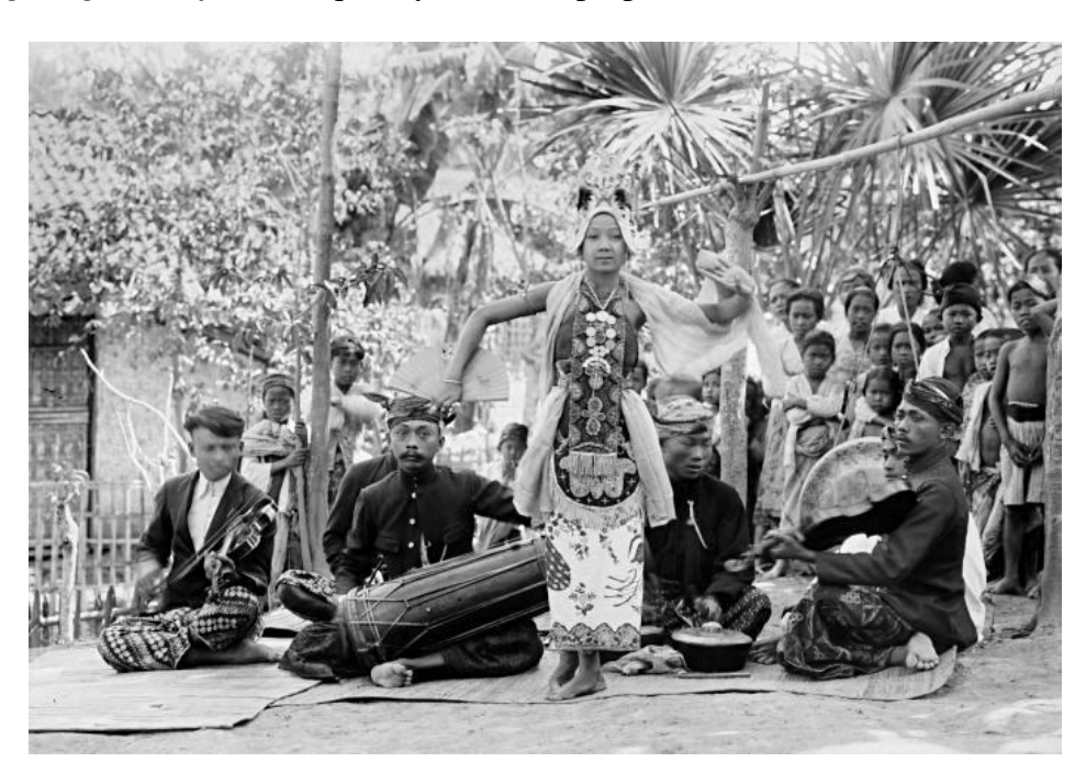
Figure 2 . The folk song is sing for Gandrung art show

(3) Edeng-edeng yo terus sun gandeng (slowly, while i hold you) Puter-puter geno gelis pinter (going round and round to get skilled quickly) Lan mengarep sawangen temenan (and in front look carefully) Katon padang yo sunare paran (looks bright, what light it is) (4)Cang gancang yo hang gancang (hurry up, hurry up) Mak Bapak'e hang nyawang (mother and father who saw) Ojo kathik yo selaperan (don't need to go anywhere) Geno gelis gaduk tujuan (so quickly reach the purpose of life)