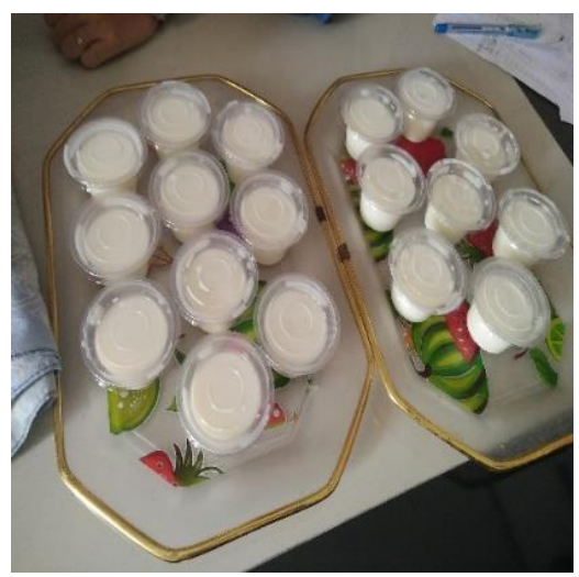
Figure 3. Example of Yogurt Packaging