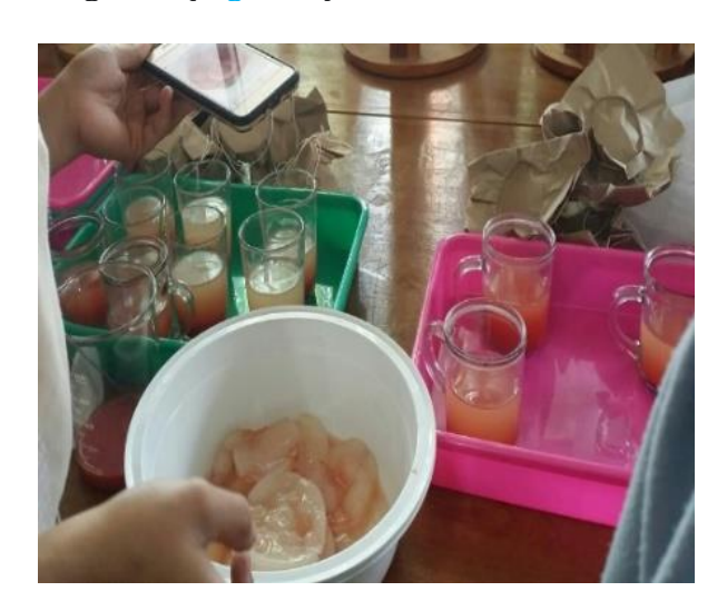
Figure 2. Nata Making Process

In this study, the biodiversipreneurship learning method was implemented in the form of conventional biotechnology practicum activities that provided direct experiences to the students in the form of making tempeh, fermented cassava and rice, nata, and yogurt with local biodiversity raw materials, as well as the further processing the products from the practicum. Through the practicum activities carried out, the students practice carrying out activities related to entrepreneurship so that they have the potential to develop their interest in entrepreneurship. Those entrepreneurial activities include determining the business product to be made, selecting tools and materials, packaging, analyzing the product strengths and weaknesses, product marketing strategies, and profit estimation. The following is a student practicum activity for making nata (Figure 2).