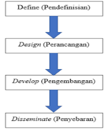
Figure 1. 4D development model (Maydiantoro, 2021)

This research was conducted by following several procedures, there are define, design, develop, and disseminate. Define, contains activities to determine what products will be developed along with their specifications. This stage is a needs analysis activity carried out through research and literature studies. Design, contains activities to make designs for products that have been determined. Development, contains activities to make a design into a product repeatedly until the product is produced in accordance with the specified specifications. Dissemination, contains activities to disseminate products that have been tested for use by others (Sugiyono, 2019).