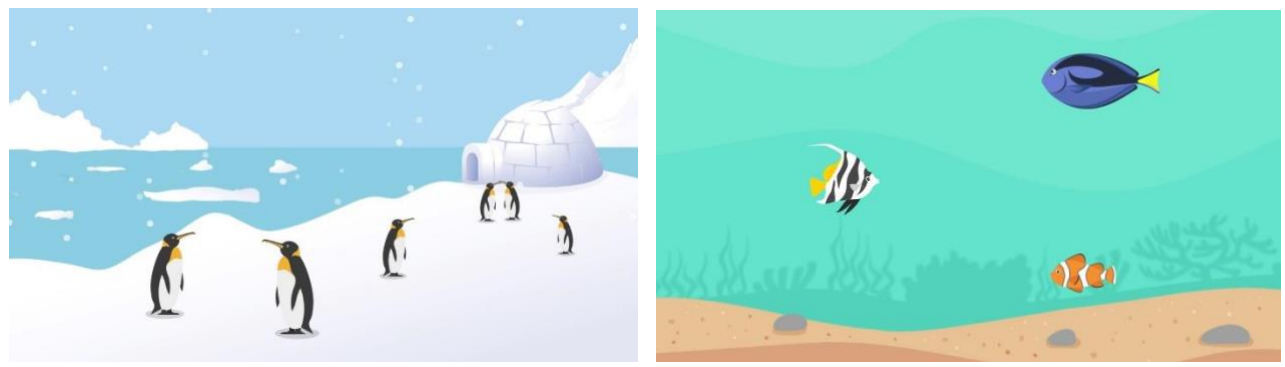
Figure 2. Display on learning media

The next stage is the development stage. At this stage, a feasibility test is carried out on the product that being developed. Based on the results of the material validation in the first phase, a feasibility percentage of 70% was obtained. It required additions and improvements based on the comments and suggestions of the material validator. After completing the revision of the product, a second phase of validation was carried out and obtained a feasibility percentage of 88%. Based on the comments and suggestions of the material validator, the product was declared eligible for testing. Based on both material validation phases, it can be concluded that the validation process shows an increase in each phase.