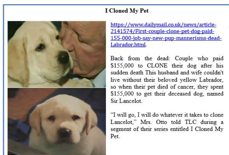
Figure 1. Student's Worksheet about Cloning