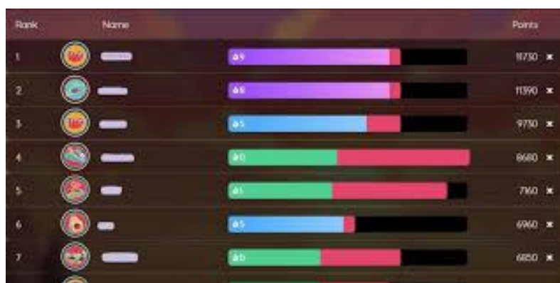
Figure 2. Students Leaderboards in Wayground