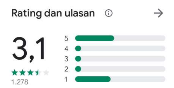
Figure 2. Citizen satisfaction on the government's response

People also have complained about the lengthy response of the government in responding to public reports. The government also did not follow up on the report effectively. This is in accordance with the citizens' assessment in the LaporApplication: