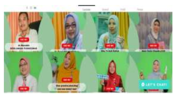
Picture 1. Menu on Kelink Emas

Based on the interviews and observations data, the innovation governance factors have been fulfilled because the KelinkEmasinnovation has been structured. In the KelinkEmas innovation, the public can carry out consultations, get information on the Puskesmas services and health-related articles. Consulting services in the KelinkEmas innovation cover 18 areas, namely health centre policies, public health, dental and oral health, midwifery care, maternal and child health, nursing care, emergency room and inpatient care, TB consultation, drug consultation, laboratory consultations, dental consultations., elderly and Hajj health, environmental health, immunization consultations, mental and covid-19 consultations, HIV and family planning consultations, administration and information, and adolescent health.