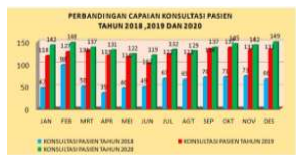
Figure 4. Comparison of Patient Consultation Achievements in 2018 to 2020