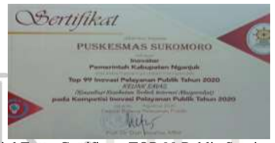
Picture 3. The KelinkEmas Certificate TOP 99 Public Service Innovations in 2020

The figure 4 above shows that the public is really taking advantage of the Kelink Emas innovation to conduct online consultations. The results of community consultations are increasing every year. Because this Golden Kelink innovation was put to good use by the community, Sukomoro Center of Public Health was successfully included in the Top 99 National Public Service Competition held by the Ministry of Administrative Reform and Bureaucratic Reform in 2020.