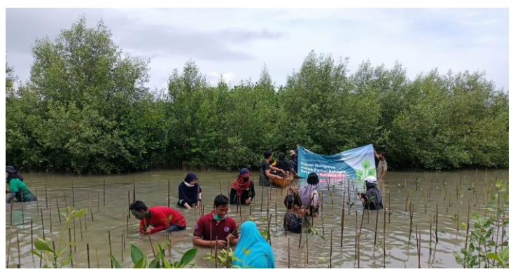
Figure 2 The Pokdarwis Alipbata community planted mangroves in collaboration with the Lindunghutan community

answered "Yes" by 83% and the crosscheck results from the community answered "Yes" by 70%.