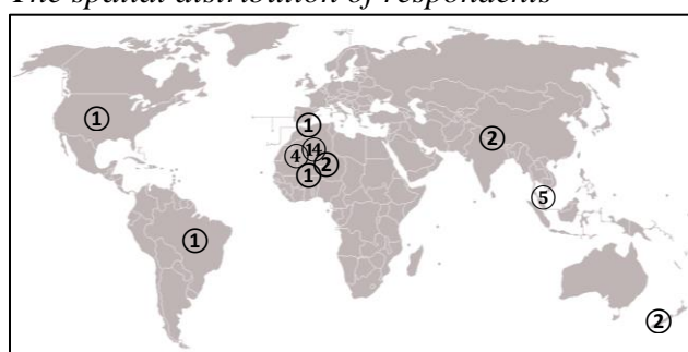
Figure 1. The spatial distribution of respondents