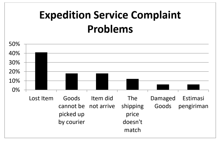
Image 1.2 Graph of Complaints on Expeditionary Services Throughout 2021

The following picture is an example of an online news article published by the BeritaHits.Id news channel regarding the case of breaking into the contents of a package by J&T Express personnel in December 2021.