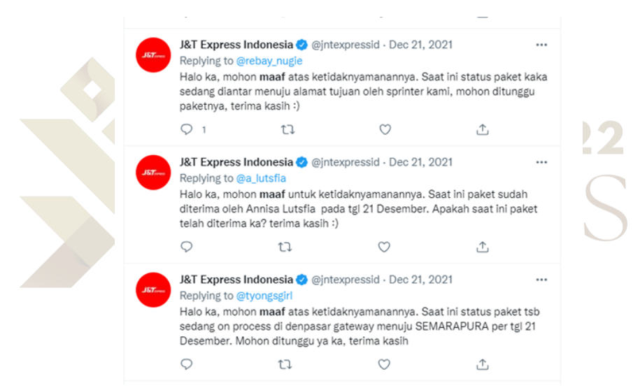
Image 1.3 Figure 1.3 Apology J&T Express on Twitter Social Media Account

J&T Express does not stand still when responding to all customer complaints on Twitter. Through our official Twitter account, J&T Express will explain the reason for the error, tell the truth, be courteous, show honesty and diligence. Figure 1.3 is an example of an apology from his J&T Express via his Twitter social media accounts on December 21, 2021.