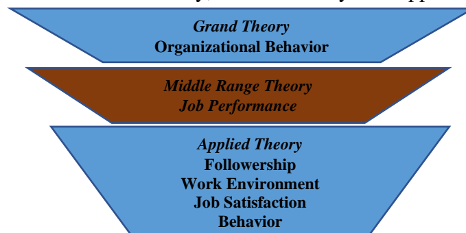
Figure 2.1 Diagram Grand Theory, Middle Theory and Applied Theory

The author identifies Grand Theory, Middle Theory and Applied Theory as follows: