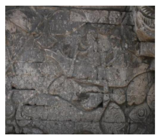
Fig. 3 Relief of puppets, a person climbing Fig. 4 Relief of a person riding boat for fishing up a tree, a person playing kite

There are several types of two-dimensional decorative motives displayed on the panels, such as motives of airplanes, cars, bicycles, and the Dutch people in War of Jagaraga. The decorative motive of the Dutchman in the decorations can be related to the history of Pura Dalem Jagaraga as Bali combat command center against Dutch colonization that written in the War of Jagaraga (1846-1849) (Sastrodiwiryo, 2011:164 —167). The composition of decorations in Pura Dalem Jagaraga in the form of reliefs are fully arranged in the fence wall of the temple building as a decoration that is integrated with the architecture. Traditional decoration is a reflection of Balinese decoration as a cultural artwork that has existed from generation to generation. Based on the objects displayed in the decorations, there are historical events that can be picked as the creativity of the cultural capital of the artists Buleleng (Sila, 2015).