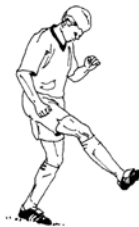
Further Movement Step

The movements that must be performed on Implementation step: (1) positioning the body up to the ball, (2) swinging the kicking foot forward; (3) staying the foot to be straight, and (4) kicking the center of the ball with the inside of the foot.