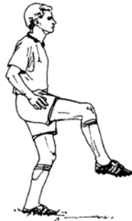
Step of Preparation

a) Controlling technique with sole of foot