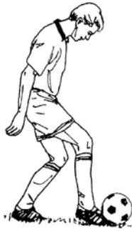
Step of Further Movement