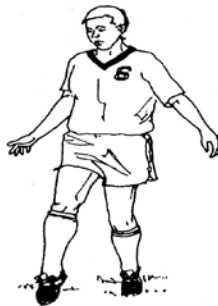
Step of Further Movement

The movements that must be performed on Implementation step namely; (a) bowing the head and positioning the body up to the ball; (b) swinging the kicking foot forward; (c) keeping the foot straightly; (d) kicking the center of the ball with the outside of the foot.