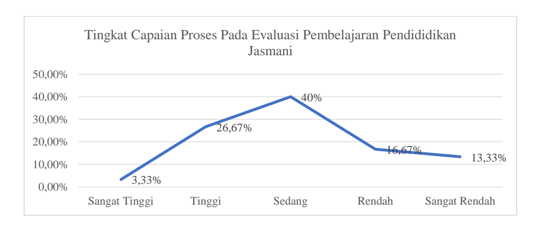
Figure 3. Graph of Process Achievement Level in Physical Education Learning Evaluation

Based on the explanation of the data above, the perception of physical education teachers on the evaluation of physical education learning related to understanding was 6.67% (2 teachers) in the very high category, 30% (9 teachers) in the high category, 20% (6 teachers) in the medium category, 36.66% (11 teachers) in the low category, and 6.67% (2 teachers) in the very low category.