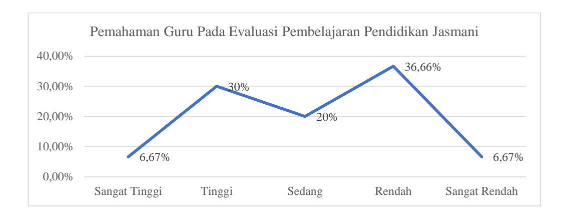
Figure 2. Graph of Teacher's Level of Understanding in Physical Education Learning Evaluation

Based on the presentation of the data above, it shows that the perception of physical education teachers on the evaluation of physical education learning in SD throughout Cibiru District is 6.67% (2 teachers) in the very high category, 26.66% (8 teachers) in the high category, 36.67% (11 teachers) in the medium category, 23.33% (7 teachers) in the low category and 6.67% (2 teachers) in the very low category.