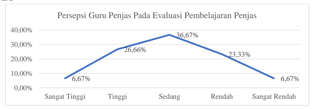
Figure 1. Graph of the Perception Level of Physical Education Teachers in the Evaluation of Physical Education Learning