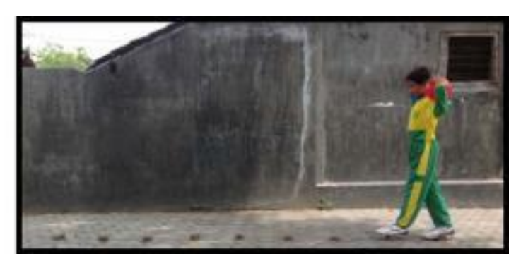
Figure 3. Dynamic balance learning model

The following is comparison of results of balance level of children before the treatment and after treatment.