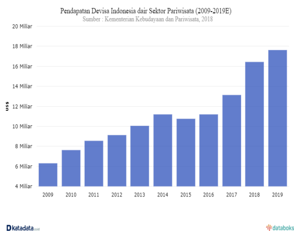
Figure 1. Indonesia's Devisation Revenue from the Tourism Sector in 2009-2019 (Kementerian Kebudayaan dan Pariwisata, 2018)

One of the potential state revenues in Indonesia is the potential in the tourism sector, which is being re-energised to continue to grow. Before the COVID-19 pandemic hit Indonesia, the tourism sector showed a significant upward trend in the last ten years. In 2019, tourism in Indonesia contributed to foreign exchange to reach US$ 18 billion.