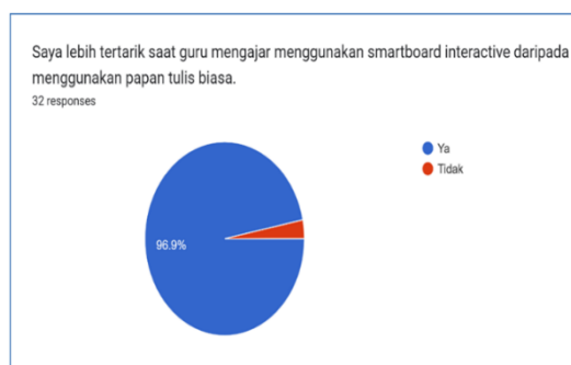
Figure 2. Student response diagram