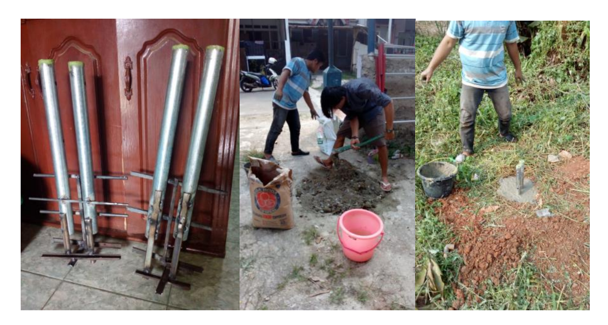
Figure 5. Installation of Foundations for PV Mini-Grid Light Poles

After the installation of the foundation is not immediately installed in one day the PLTS support poles are installed, but at least wait a few days so that they are strong and sturdy completely dry for cement and the under foundation. Installation of foundations for PV mini-grid light poles can be seen in Figure 5.