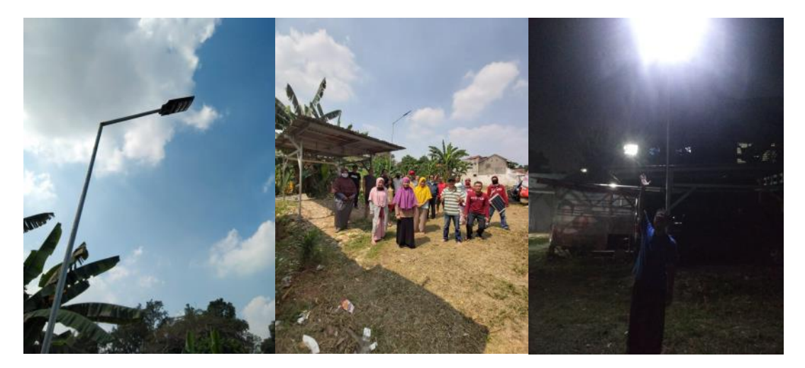
Figure 6. Results of Installing PLTS with Residents

These results provide clear evidence that solar energy can be used to generate electricity which will be used for lighting, lighting the parking area which is still dark. Until now, the results are still being monitored, it turns out to be very effective. It is proven that it can light up from 18.00 to 05.00 WIB, it is proven every day by residents who pass and see the results of the PLTS installation. And the surrounding community is very happy and understands how great our solar energy has been. In this analysis, it is adjusted to the results of "Journal of Community Service on the Light of the Country" Vol. 1, No. 2, July 2019 (DOI: https://doi.org/10.33322/terang.v1i2.369) An economic analysis of the installed solar lamps was carried out to see the economic benefits compared to the use of incandescent lamps for PJU. The lamp that is installed is an incandescent lamp because according to the residents' incandescent lamps are cheaper than LED or TL lamps. At this point, the comparison will be analyzed from the economic side of PJU solar lights with incandescent PJU for 1 light point over 5 years. For more details the results of installing PLTS, seen Figure 6. below.