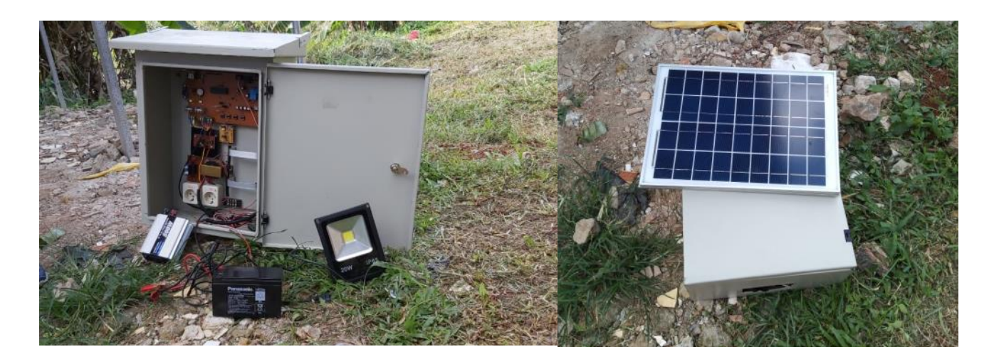
Figure 3. Components and Parts of PV Mini-Grid

In socialization, people are quite enthusiastic about exploring and curious about the technology where many of them do not know and understand why sunlight can produce electrical energy. So that is where our big role as lecturers and intermediaries in the world of technology is very much needed and helps the surrounding community. For more details components and parts of PV mini-grid, seen Figure 3. below. Documentation explanation of PV mini-grid can be seen in Figure 4.