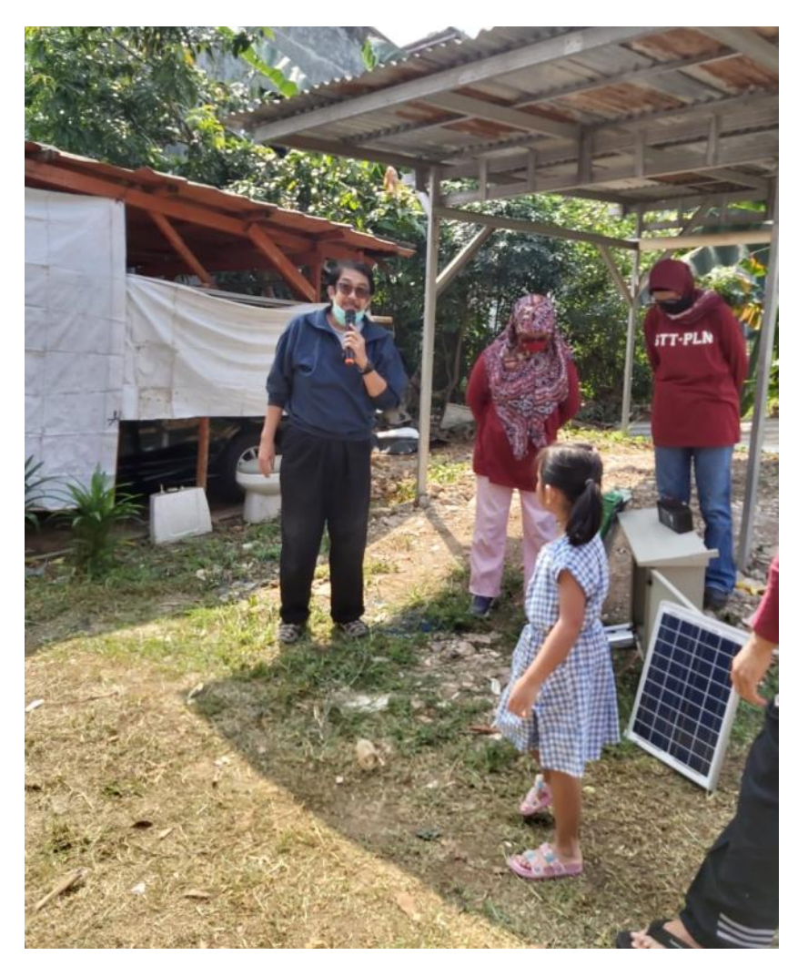
Figure 4. Explanation of PV Mini-Grid