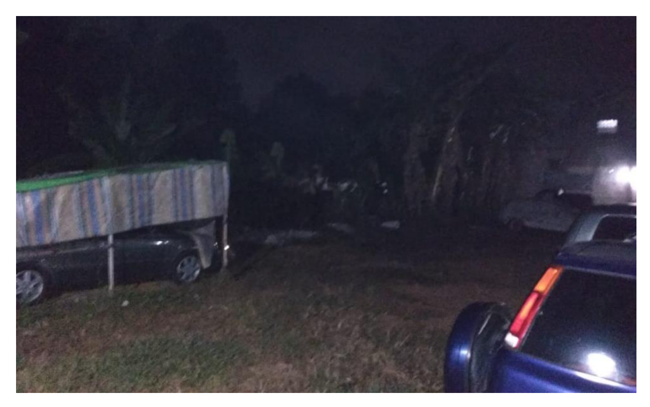
Figure 1. Conditions to be installed PLTS

In today's life, technology is rapidly developing, the need for electricity is also increasing, PLTS has become a common item in society, but goods and their forms are still considered expensive because they are not and there are no sellers in every region, which are still rare and expensive product categories. Therefore, the situation and conditions in the place or area of this service that is carried out are a general area, where the night light is still lacking or dark, can be seen in Figure 1.