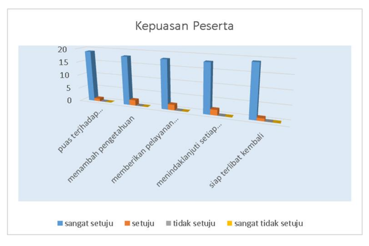
Graph 4 Participant Satisfaction

Based on the graph 3. above, it can be seen that the level of ability of the participants varies. However, if viewed as a whole from the results of the assessment in terms of material management, 25% of the participants got a very good range of scores of 86-80, 50% of the participants got good scores in the 70 -80 range there were 10 people or (50%) and as many as 5 people25 % scores is good enough that is in the range 70-60. If average, it shows that the ability of the participants to master the material can be said to be good, this is shown by the participants who get a score in the 70-80 (B) range of 50% or half of the number of participants, even though there are participants who have excellent or good enough mastery of the material, it can be concluded that participants can follow and understand the material given by the speaker well.