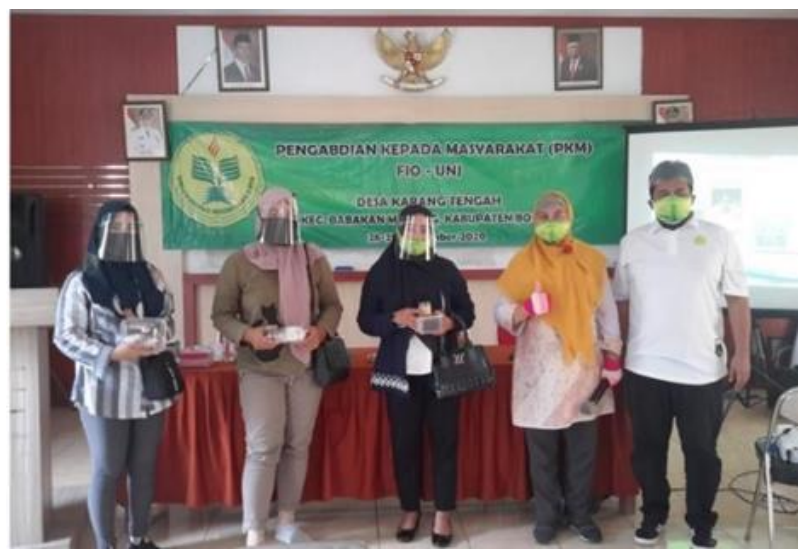
Image 5. The Practice of Making Decorative Candles from Used Cooking Oil