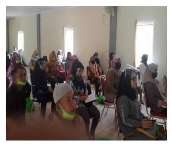
Image 4. Socialization of Danger and Utilization of Household Waste