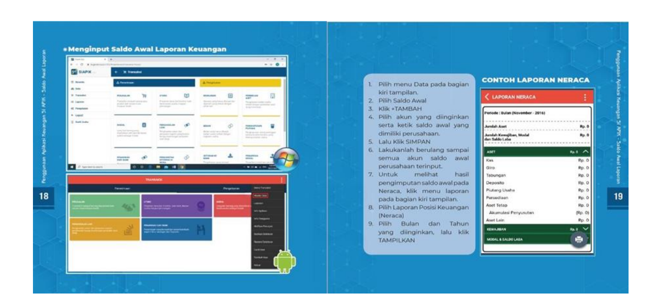
Figure 3. Training Materials on Manual Book