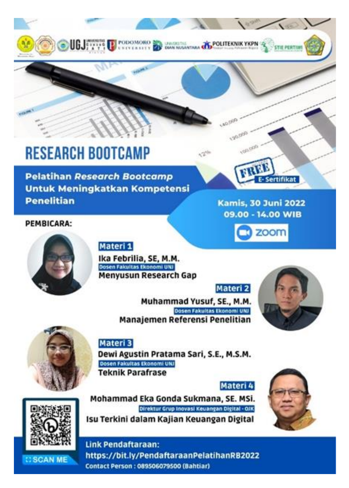
Figure 1. Training activity flyer