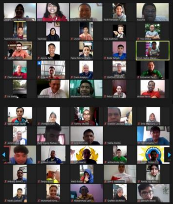
Figure 1. Flyer and activity documentation