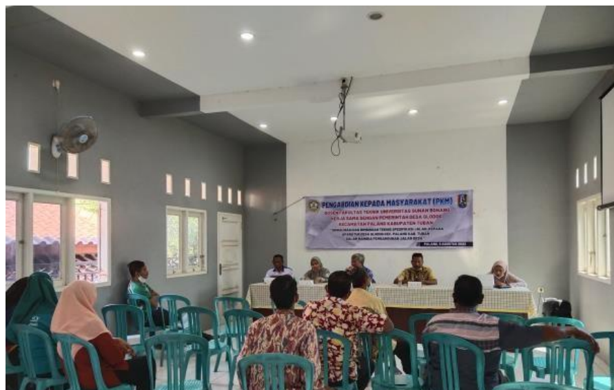
Figure 1. General condition of implementation of activities

The implementation of socialization activities and technical guidance on road specifications was carried out in the meeting room on the 2nd floor of the Glodog Village Hall, Palang District, Tuban Regency. The activity begins with the arrival of participants by first filling out the attendance list before occupying the available seats. In accordance with the target of the activity participants, the participants who attended included all Glodog Village officials, the Head of the BPD and community leaders. As an illustration of the general conditions for the implementation of activities at the event session, it can be shown in Figure 1.