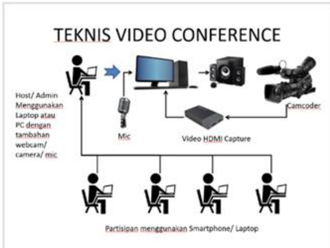
Figure 2. Video Conference Technique