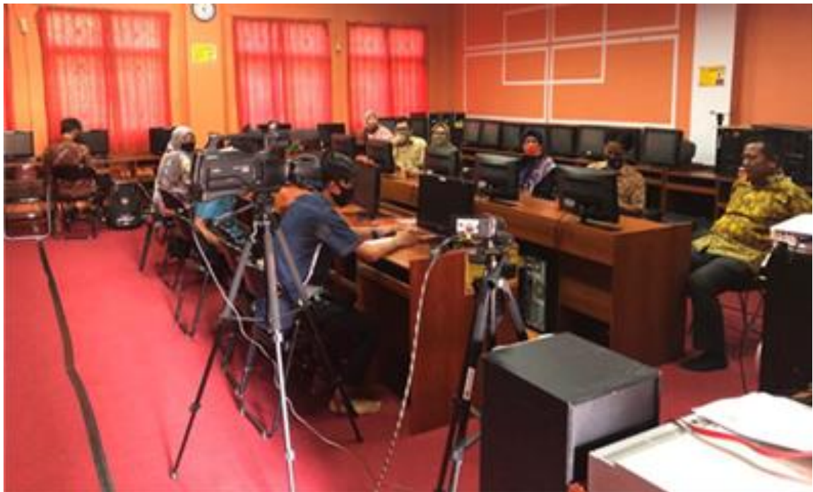
Figure 5. Participant of training video conference