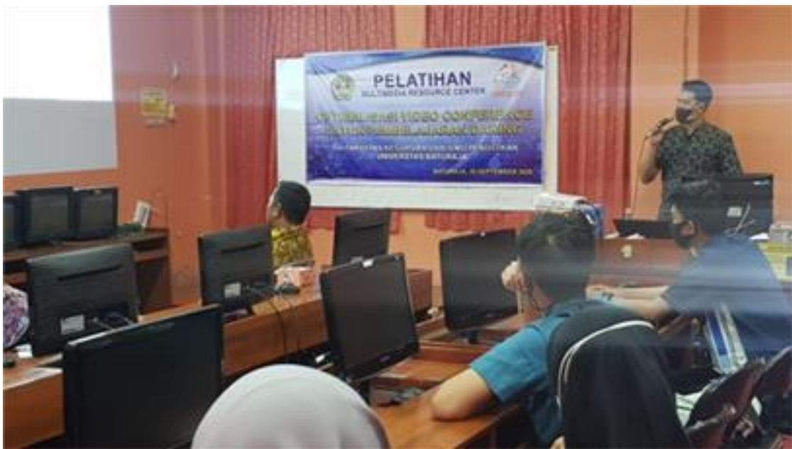
Figure 4. Training of operating video conference