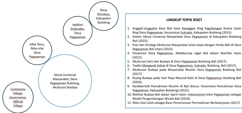
Figure 1 State of The Art

In addition, there is also a previous research on the topic of the history of Pegayaman Village, the results of the literature review found that there is information related to the history of Pegayaman Village, but it is still packaged randomly and has not been conceptually mapped. Meanwhile, generation Z is easier to absorb information that is packaged conceptually, so this research is important to synthesize the information on the origin of Pegayaman Village, so that it can be grouped and mapped, so that it is easier for generation Z to absorb and accelerate the process of regeneration of historians from Pegayaman Village. Then, what are the results of the conceptual study of the origins of Pegayaman Village, Suksada District, Buleleng Regency, Bali?