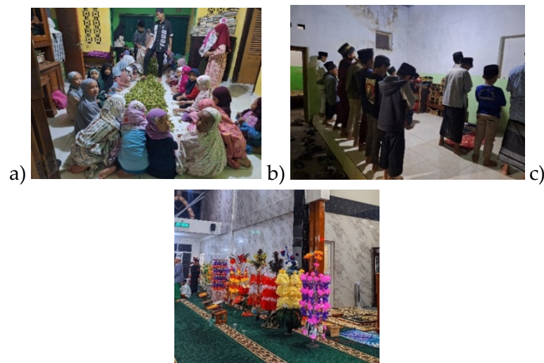
Figure 3 Conservation of Pegayaman Village's Superior Identity

was found that the nuances and characteristics of the residents of Pegayaman village intersect with 6 identities that have been formed to date and their existence is maintained and continues to be inherited through customary traditions that are integrated with religious, socio-cultural, and artistic activities. The following is a series of documentation data findings related to the treatment of 6 identities carried out by the people of Pegayaman Village.