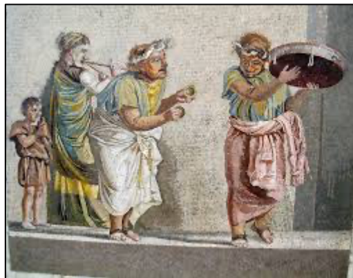
Figure 4. The Music Life Down the Streets Performance in Rome

news of war, and unite through shared emotional experiences (Power, 2022). Performances symbolized collective responses to fear, conflict, and survival, transforming suffering into solidarity and hope (Power, 2022). Through song and rhythm, individuals aligned their emotions and beliefs, creating a shared cultural voice that resonated throughout Roman society.