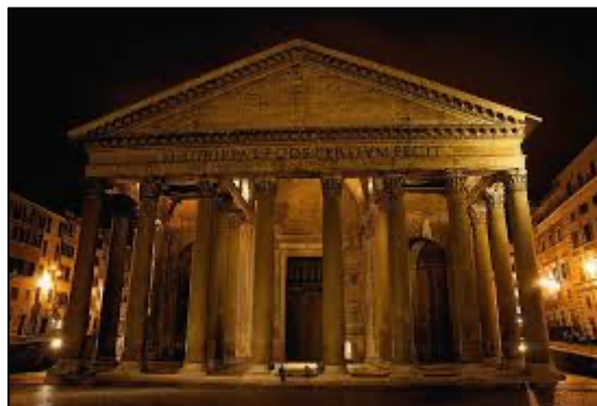
Figure 3. The Roman Temple of Shrine

Mathematical reasoning and symbolic representation influenced decision-making, including political outcomes and social predictions. Talismans and numerical systems were used to interpret fate, probability, and the perceived order of life (Barber, 2022). Ethical debates emerged around authority and persuasion, emphasizing the importance of understanding and consent within Roman governance (Barber, 2022). Alphanumeric records enabled societies to document events, preserve collective memory, and pass historical knowledge to future generations (Barber, 2022).