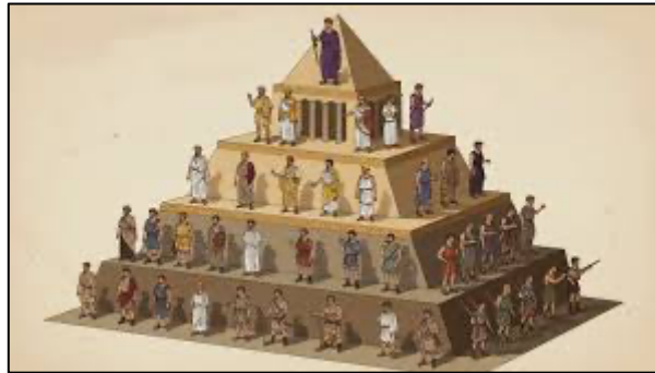
Figure 1. The Social Justice Employed on Their Diversity

Social diversification was encouraged through innovation and mutual influence. Communities developed solutions that reinforced established standards while allowing cultural differences to coexist within institutional frameworks. These systems aimed to preserve continuity and social evolution, often supported by military organization and governance structures (Tucker & Omwenga, 2025). Symbolic processes of encoding and decoding information reflected humanity's attempt to connect earthly systems with divine order, drawing upon principles of energy, magnetism, and structural balance (Tucker & Omwenga, 2025). Engineering advancements, such as water-based technologies, represented breakthroughs that sustained life and reinforced collective progress (Tucker & Omwenga, 2025).