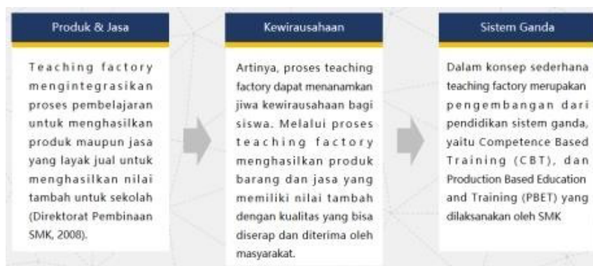
Figure 2. The relationship between Products & Services, Entrepreneurship, and Dual Systems

The Teaching Factory concept is a development of the interrelationship of production-based education, entrepreneurship, and dual system education. The following is a schematic of the linkage between products and services to entrepreneurship and dual system education.