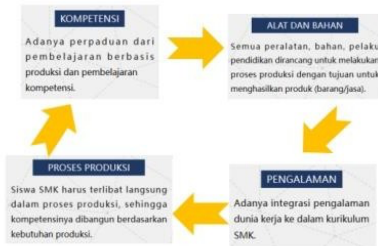
Figure 1. Interrelationships in the Implementation of Teaching Factory

Interconnected components in the Teaching Factory program in SMK can be briefly described as follows: