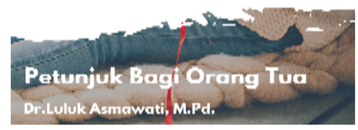
Figure 2. Early Childhood Parenting e-book (https://www.canva.com)