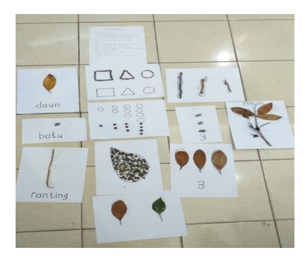
Figure 2. Children make geometric shapes from mangrove leaves and twigs

content quickly and precisely. The illustration of the show of loose part media can be drawn by the example on figure 2 & 3: