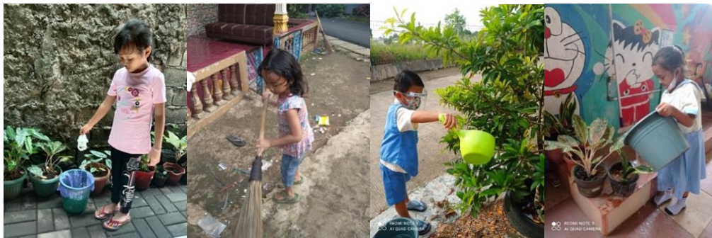
Figure 3. Children Environment Education Activities

One of the activities carried out in this research is to start inviting students to plant trees or watering trees for children whose houses already have plants or asking students to help clean their homes and schools, furthermore, the activity of walking out of school to observe the cleanliness of the nearest environment and to instil a feeling of loving the green environment outside the school and where children live (see figure 3).