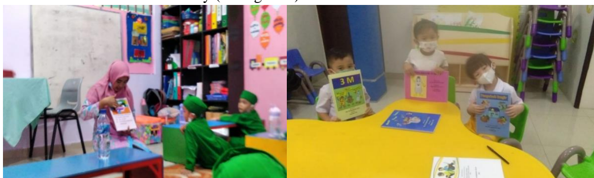
Figure 2: children are reading a book about the environment

Researchers in the third phase made observations on learning in early childhood classes to see the improvement of teachers' abilities in developing environmental education and children's literacy. The activities outlined in this paper are reading activities to improve children's environmental literacy (see figure 2).