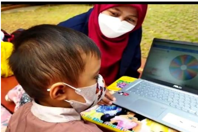
Figure 5. Children Play