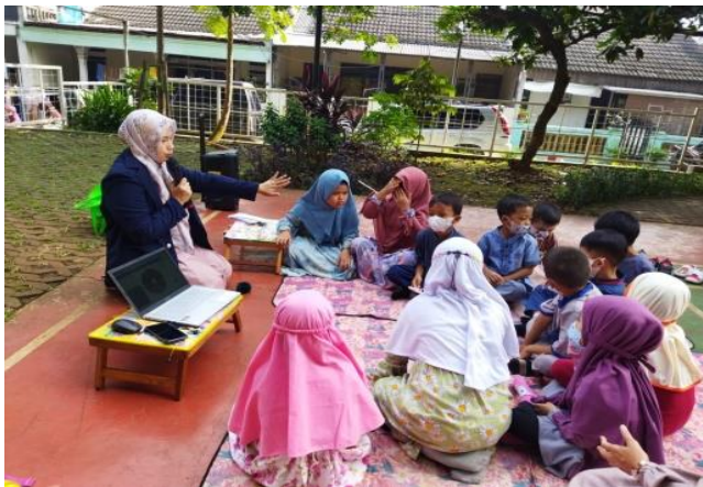
Figure 4. Teacher Gives an Example of How to Play