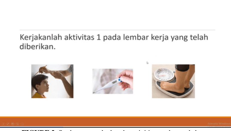
FIGURE 2. Students are asked to do activities on the worksheet

In addition, students are also asked to work on worksheets that can help students achieve formal knowledge about the concept of function.