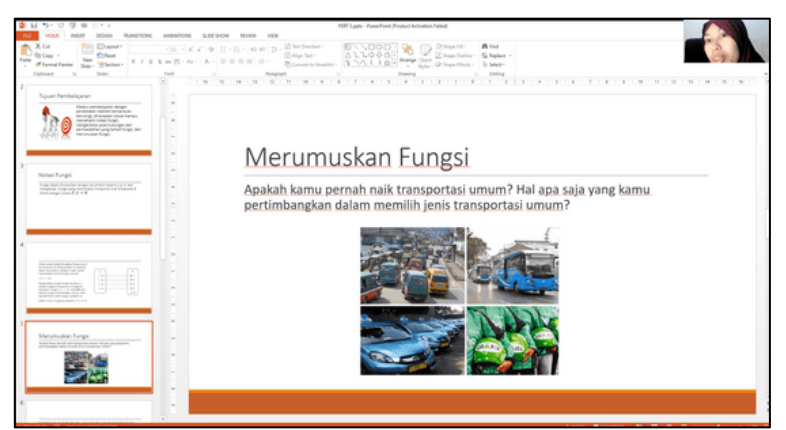
FIGURE 3. Teacher present a context at the beginning of lesson

Learning at the third meeting aims to make students able to formulate functions. At the beginning of the lesson, the teacher presents a context that is close to the daily lives of students, namely about public transportation fares. Through this context, students are guided to be able to formulate functions.