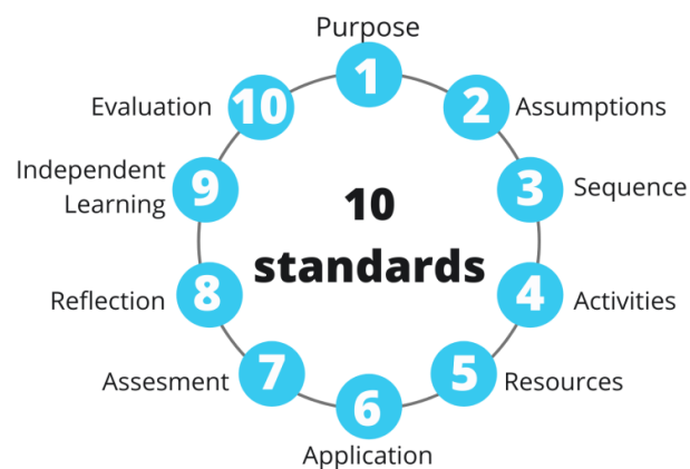
Figure 3. Ten Standards of Online Learning by AECT (adapted from Piña, 2018)

The research results section related to learning using flipped classrooms will be structured according to the ten learning standards by AECT.