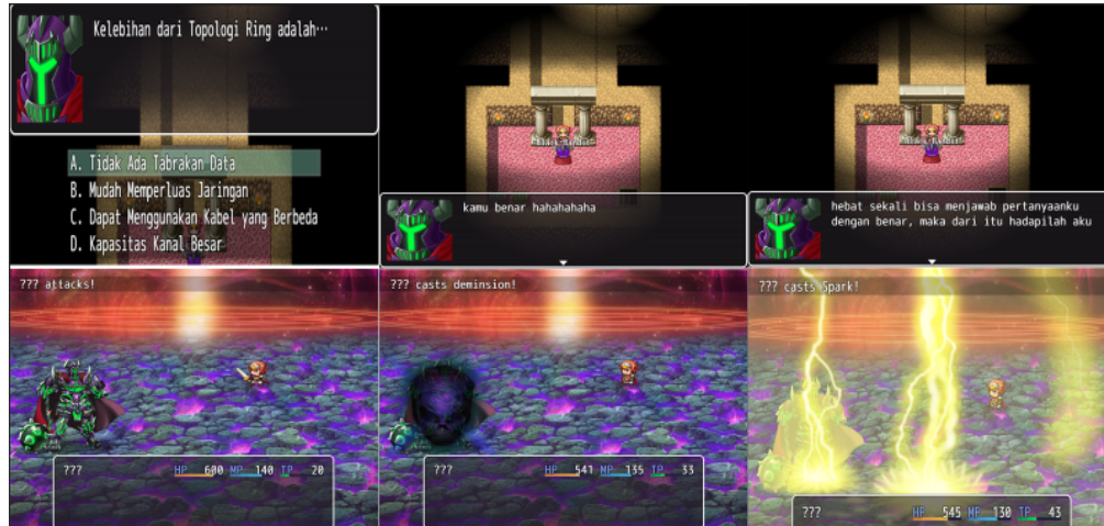
Figure 4. Evaluation of Learning through Battle with Enemy

player can answer correctly, the player will be given an advantage, but on the other hand, if the player answers the question incorrectly, the enemy will get an advantage. An example of an evaluation in this game can be seen in Figure 4.