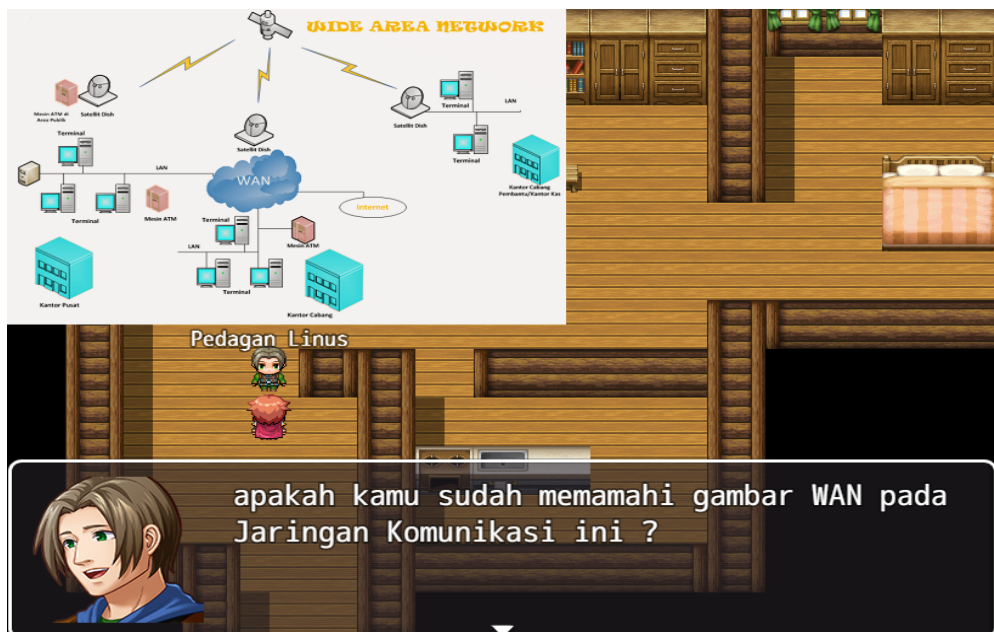
Figure 3. Delivery of Data Communication Materials through Dialogue with NPCs

After the map is finished, the next step is to make an NPC for each map. NPCs function to provide materials to players through dialogue, questions, or quests. An example of delivering material from the NPCs can be seen in Figure 3.