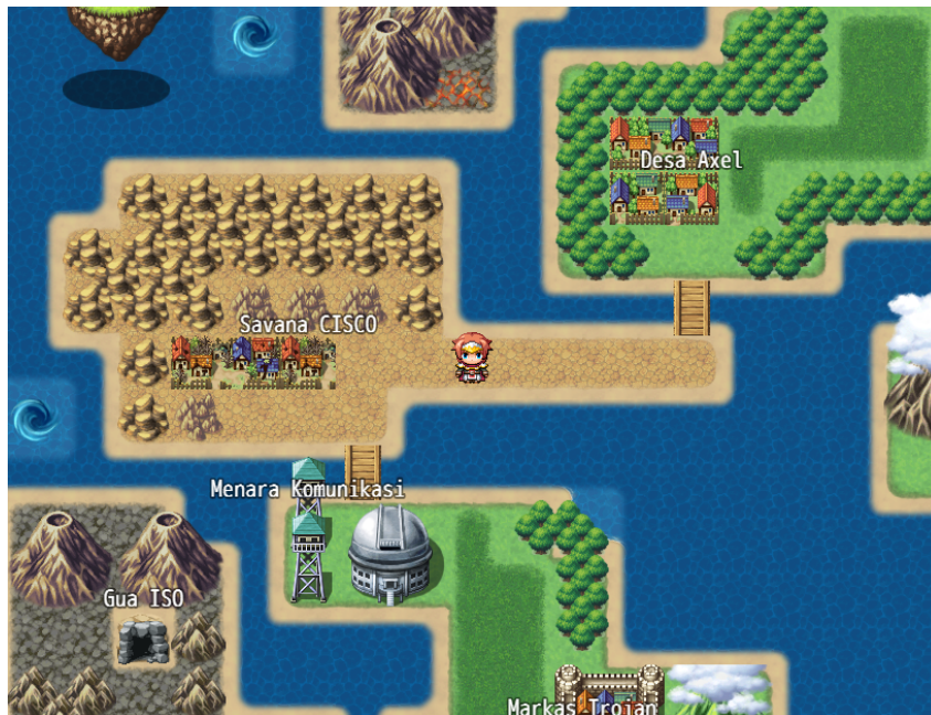
Figure 2. Map of Educational Games for Data Communication Courses

After the map is finished, the next step is to make an NPC for each map. NPCs function to provide materials to players through dialogue, questions, or quests. An example of delivering material from the NPCs can be seen in Figure 3.