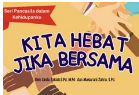
Figure 5. Storybook Fourth Edition of Pancasila Precepts

The fourth edition of the picture story book of Pancasila values which contains about how to behave in accordance with the fourth precept, namely "Peoplehood led by wisdom in representative consultations" this book is entitled "We Are Great if Together". The title of this book conveys the fourth precept as an Indonesian nation that always prioritizes deliberation for consensus in every decision making that reflects a democratic life. In this storybook describes attitudes that are in accordance with popular values that prioritize public interests rather than personal or group interests. Thus, there will be no more disputes in public life because everything is done on the basis of togetherness for the common good.