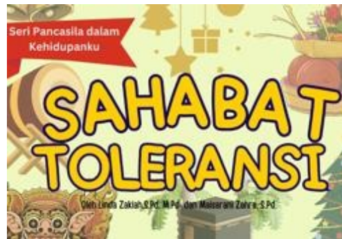
Figure 2. Storybook First Precept Edition of Pancasila