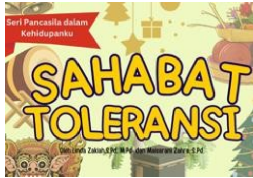
Figure 6. Fifth Edition Story Book of Pancasila Fifth Precepts