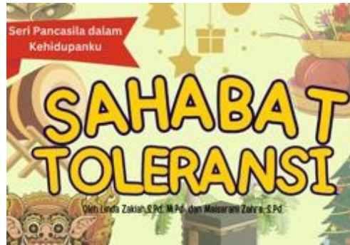
Figure 4. Third Edition Storybook of Pancasila