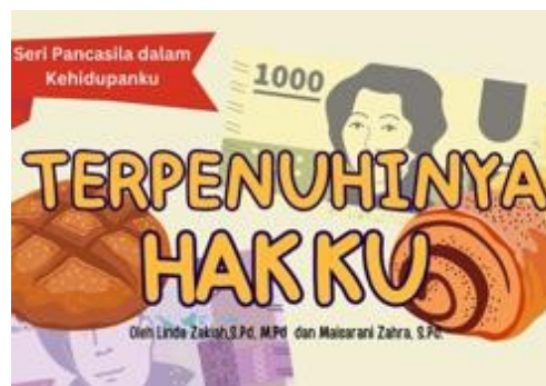
Figure 3. Second Edition Story Book of Pancasila Second Precepts

The second edition of the picture story book of Pancasila values which contains about how to behave in accordance with the second precept, namely "Just and civilized humanity", this book is entitled "The Fulfillment of My Rights". This is because in the second precept that everyone has human rights. This book tells a child has a haka son. When every child fulfills his rights as a child, he must be grateful and not forget his obligations as a child. This second edition of the storybook is expected to allow students to understand their rights as children and carry out their obligations as children with awareness and responsibility. The story in the second edition of the book related to the attitude of Pancasila values in accordance with the second precept includes: mutual help and help fellow humans and act justly.