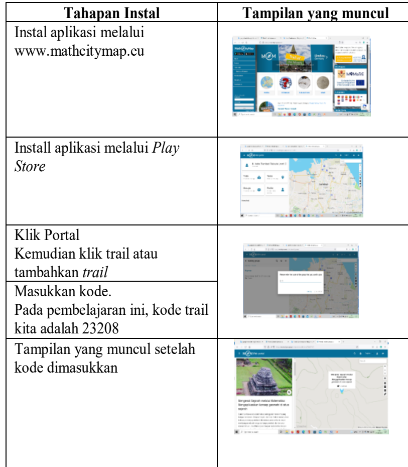
Figure 1. Aplikasi Math City Map

the groups, the teacher explains the equipment that must be brought by the students, namely stationery, meter or ruler, book or HVS paper, chest board. The teacher also needs to emphasize the time of gathering at school, because Outdoor Learning activities are carried out outside the classroom, so it is necessary to prepare for departure.