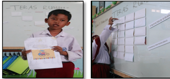
Figure 3. Student lithography journal from home

Based on the summary of the results of interviews, observations, and documentation at the input evaluation stage, it can be concluded that the GELIS Program at Elementary School has good support in terms of infrastructure and coordination between the school committee and parents. Reading corners that have been built in each class, an adequate collection of books in the library, and the active participation of parents in the construction of reading corners at home are positive indicators.