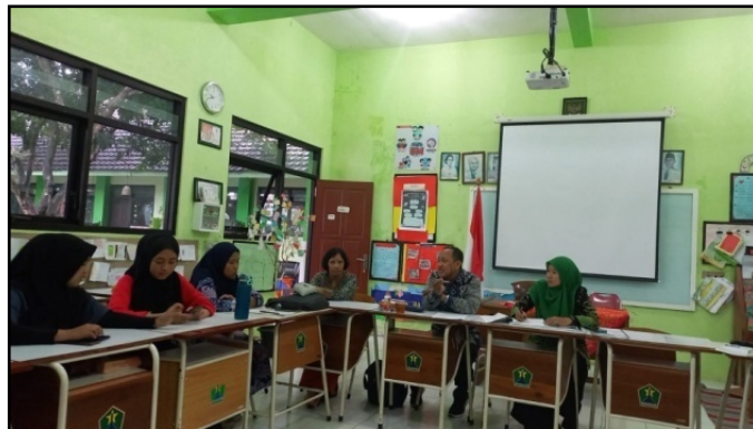
Figure 2. Monthly committee and parent meetings

"Parents at Elementary School are very supportive of the literacy program. They build reading corners at home and actively buy books for the children. There is a reading journal for each student, and we see many parents involved in motivating their children to read at home."