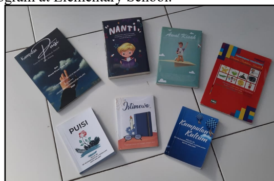
Figure 4. One month one book

Here are the results of research documentation obtained by researchers related to various activities in the GELIS program at Elementary School.