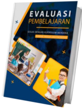
Figure 1. Cover of Learning Evaluation Book