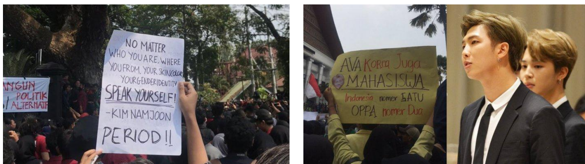
Figure 4: Some of protesters posters in student rally against the Indonesian government in September 2019.

The fandom organizer, in this case is ARMY, have assumed the role of cultural intermediaries, capitalizing on the algorithms of social media to appropriate, copy and paste, as well as circulate idol images across converged media platforms. They have also actively incorporated the self-made hashtag #BTSLOVEYOURSELF to disperse idol's message in wider audience. Sometimes when the tweet from official accounts using Korean language, some fans are involuntarily help with English or local language translation, thereby