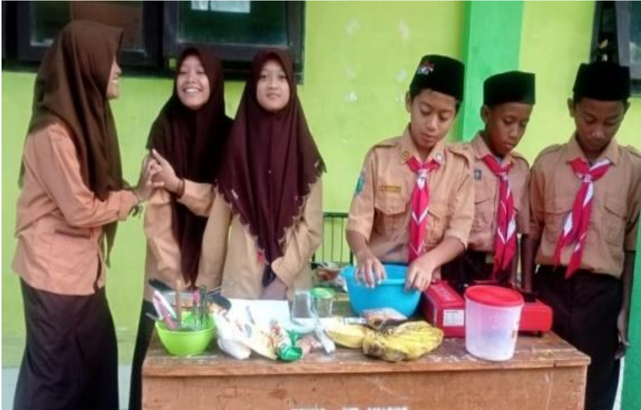
Figure 3. Students Practicing Crafts

The learning process is carried out in accordance with the teaching tools that have been made. Learning activities for processing aspects of craft subjects in the classroom, the teacher coordinates the class so that students are not crowded. The teacher explains the material and students participate actively in the teaching and learning process, the teacher gives questions to students and does not forget to motivate students. At the beginning of learning craft practice in the processing aspect, the teacher will give instructions on the ingredients to be processed, then students will discuss and look for ideas for food to be made. After discussion and searching for ideas, students will make presentations in front of the class to convey the food that will be made.