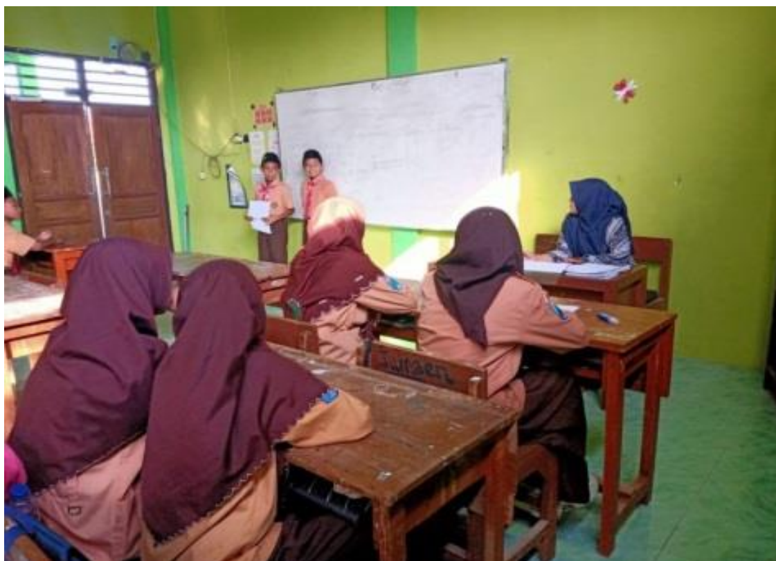
Figure 2. Implementation of Learning Craft Subjects

According to (Wijaya, 2024) craft subjects have the principle of student creativity that uses basic technology to produce high skill competencies. Craft subjects have the meaning of developing the creativity that exists in students and developing entrepreneurial traits. (Ariska & Khairi, 2023). The existence of craft subjects is expected that after graduating students can use the skills they have learned at school for their personal independence (Amin, 2023; Sunaryo, 2023)