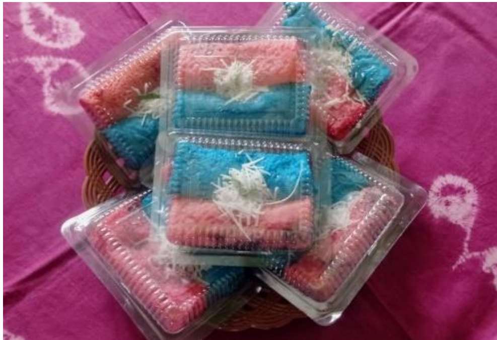
Figure 4. Results of Craft Practices in the Processing Aspect of Class VII Students

In Figure 4. above is the result of the practice of processing aspects of craft subjects with the material of processing fruit food ingredients which they processed into chocolate banana omelet rolls with cheese topping. Traditional snacks were chosen with the aim of preserving regional specialties and adding insight for students.