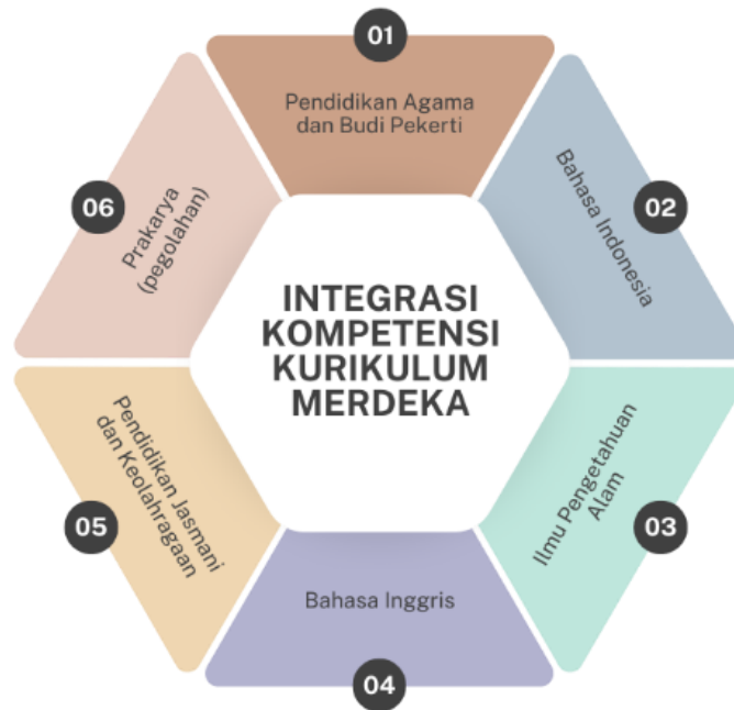
Figure 5. Integration of Competencies in Craft Subjects in the Kurikulum Merdeka