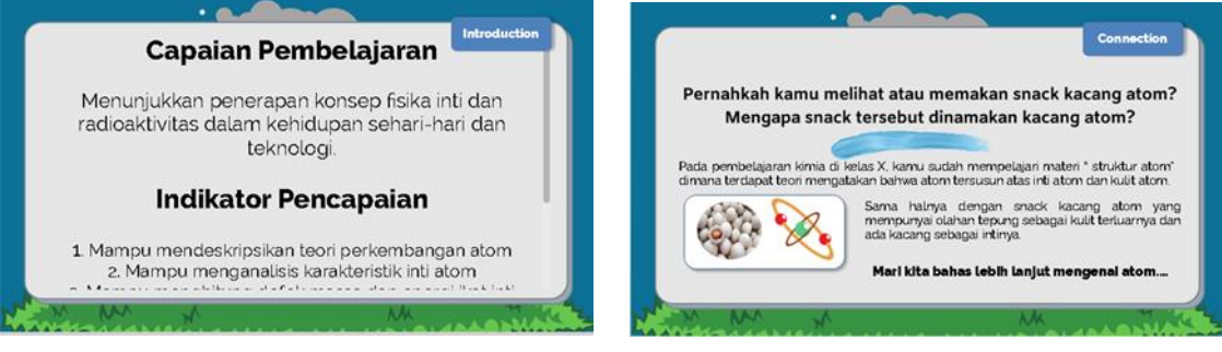
FIGURE 4. Introduction - Learning Outcomes