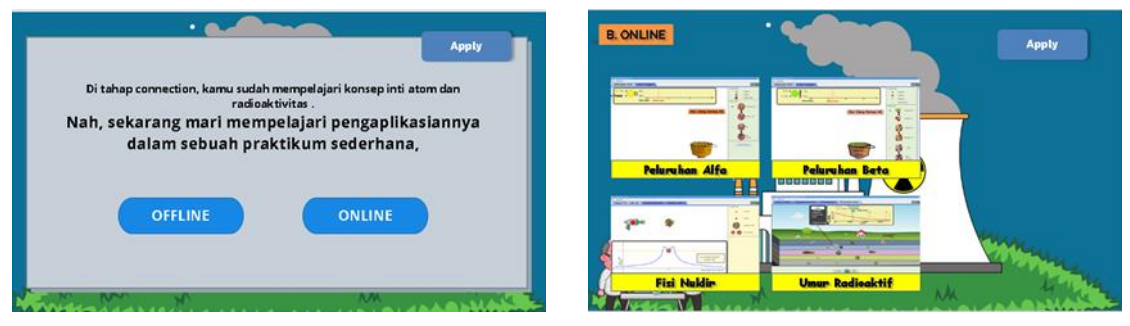
FIGURE 6. Apply Menu