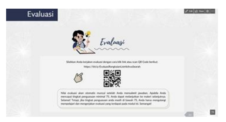
FIGURE 6. Display of Evaluation