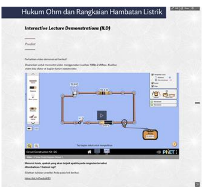
FIGURE 3. Display of ILD Syntax in Predict Step