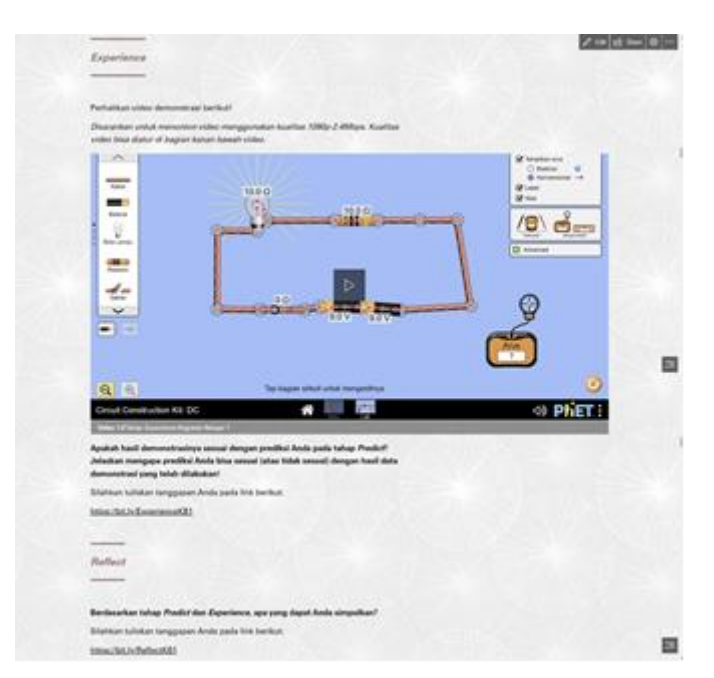
FIGURE 4. Display of ILD Syntax in Experience and Reflect Step

To help students understand the materials, in each learning activity, after the Syntax of Interactive Lecture Demonstrations, there is learning material, sekilas info fisika, sample questions, practice questions, and a summary. "Sekilas Info Fisika" is a page that aims to add insight for students. This page contains the application of physics or natural phenomena related to physics, especially related to electricity.