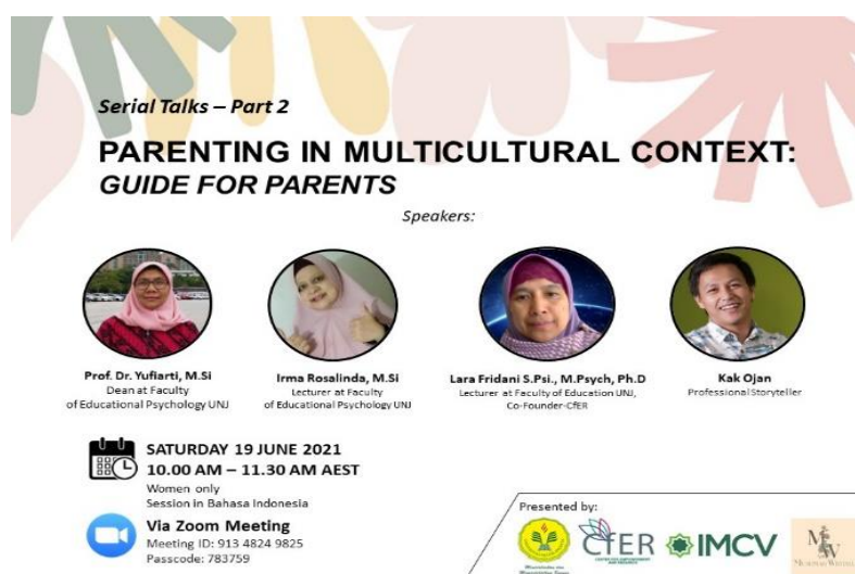
Figure 2. Implementation

The activities communities services have already done since June 2021 by zoom. Some of women who stay in Australia follow this activities as 40 participation. The activities of communities services include 1) preparation, 2) implementation and 3) evaluation. The preparation, The preparation include meeting with Cfer organization, IMCV and made socialization if this activities, such bellow.